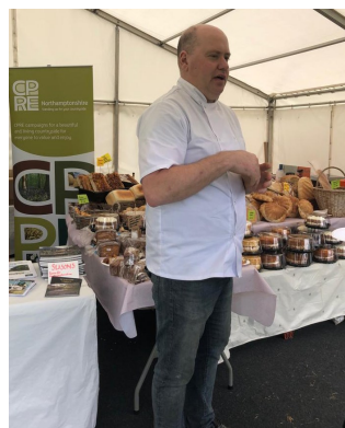
Manning the stand at Rockingham

CPRE Northants welcomed newcomers, Whittlebury Bakery, to the CPRE marquee at the Rockingham International Horse Trials event that was held from 17 - 19 May 2019.