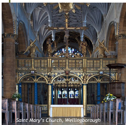
Saint Mary's Church, Wellingborough

There will be twelve sites: most feature