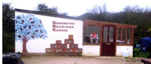
Geddington Brickyard Garden