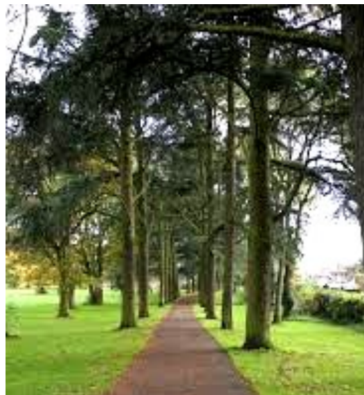
The Friends of Eastfield Park, Northampton